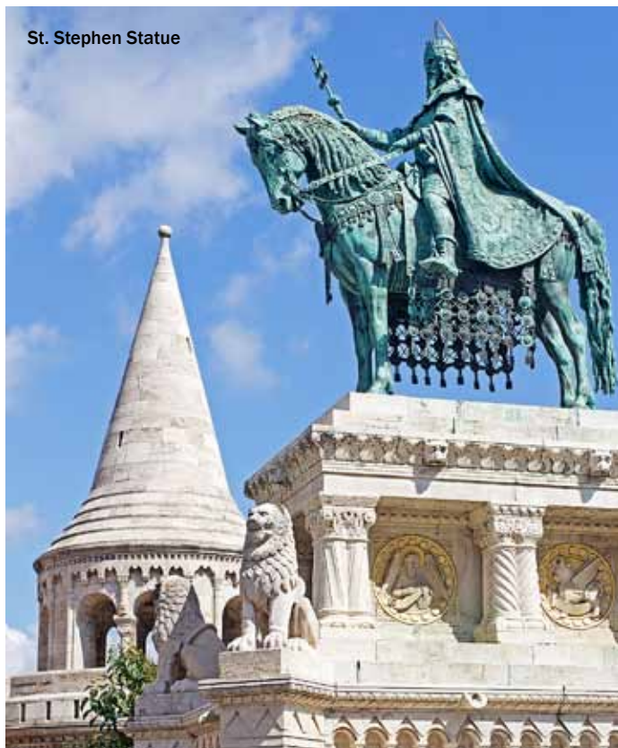
St. Stephen Statue

After breakfast (included), join a day-long bus tour of Budapest. See the ancient and modern sides of the city and enjoy tales of citizens and foreigners who make history come alive. From Hero's Square and Andrassy Avenue, to the heights of Gellert Hill and the Castle District, you will visit places where the historically rich and famous have stood. Relish photo possibilities from the Fisher Bastion and Matthias Church. A visit to the Parliament interior will astonish with the architecture and vision of the